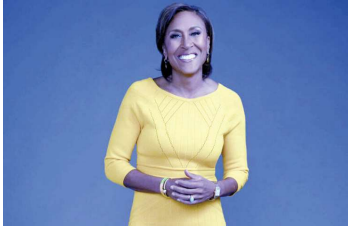
Robin Roberts, ABC-GMA, co-anchor