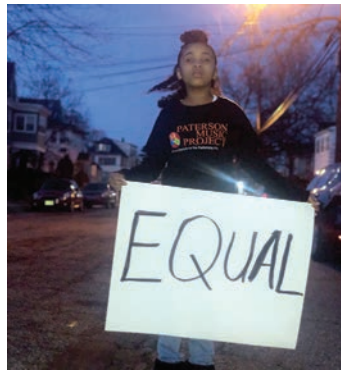
MLK Celebration, Student photo