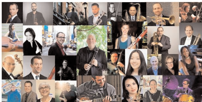
Instructor-Student collage