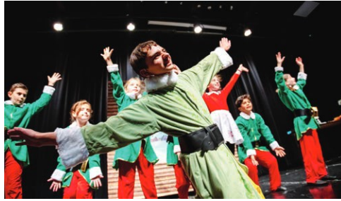
Wharton Players, 2019