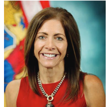
NJ First Lady Tammy Murphy