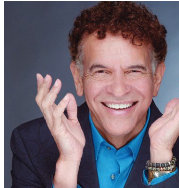
Actor-Singer Brian Stokes Mitchell