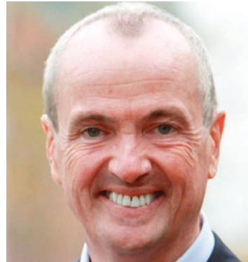
NJ Gov. Phil Murphy